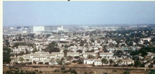
Accra from a sky view