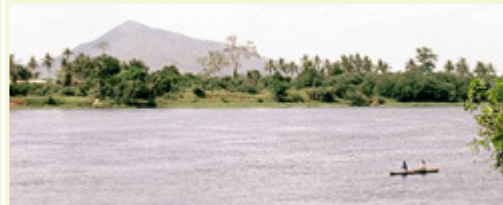
The Volta lake

ABURI BOTANICAL GARDEN: 40KM north of Accra- created in the 1890s as an agricultural research station, sanatorium and leisure resort. Has a wide variety of plants, flowers and trees