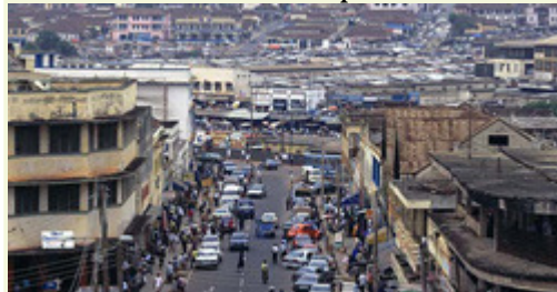
Kumasi from a roof top view

BOABENG-FIEMA MONKEY SANCTUARY 22km from Nkoranza – Monkeys like the Colobus the Mona and many more are seen